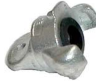
Dead End (DE)