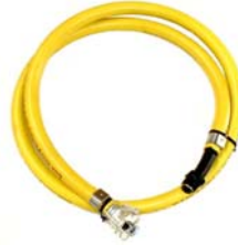
Whip-7/8-HD 7/8-24 Thread X 6 ft