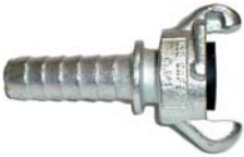
Hose End (HE)