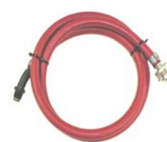
Whip-1/2-STD 1/2" Pipe Thread X 6'