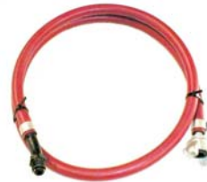
Whip-7/8-STD 7/8-24 Thread X 6 ft